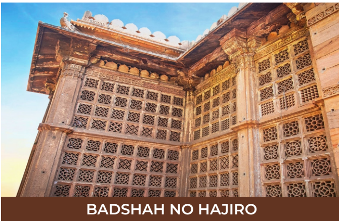
BADSHAH NO HAJIRO

Sultan Ahmad Shah, founder of Ahmedabad, is buried here with his son Mahmud Shah II and grandson Qutbu'd Din Ahmad Shah II. His tomb, built in 1451 AD, honors his legacy.