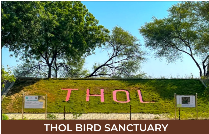
THOL BIRD SANCTUARY

Thol Lake Bird Sanctuary, located 27–40 km northwest of Ahmedabad, spans 7 square kilometers. Established in 1988, it hosts over 320 bird species, covering 57% of Gujarat's avifauna.