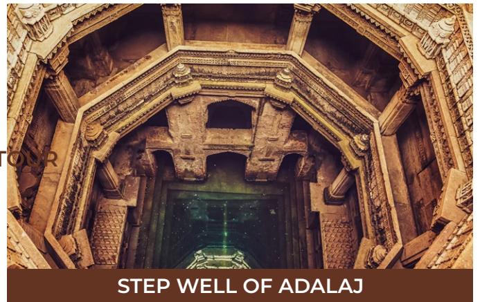
STEP WELL OF ADALAJ