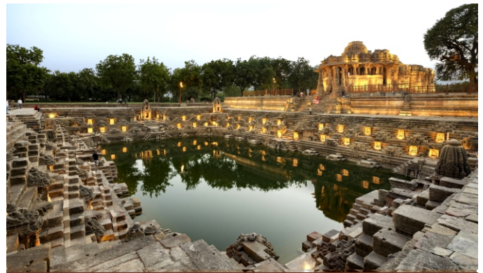
MODHERA (SUN TEMPLE)

Sidhpur, 103 km from Ahmedabad, is a sacred town on the Sarasvati River, named after ruler Siddhraj Jaisinh. It is known for temples, kunds, and French-style villas, mainly inhabited by the Bohra community.