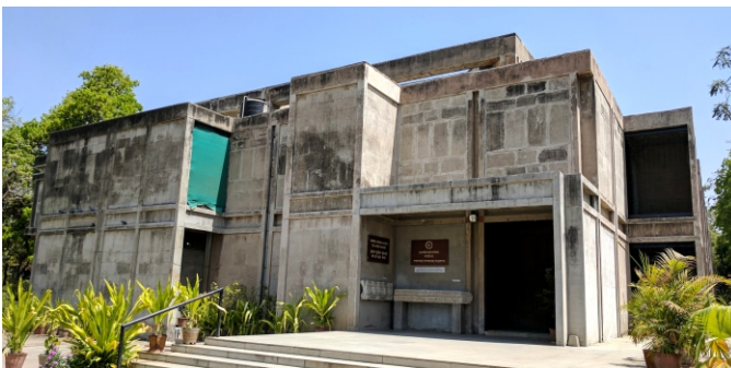
LALBHAIDALPATBHAIMUSEUM OF INDOLOGY

Vishala Museum with Restaurant in Ahmedabad offers a unique experience, featuring a vast collection of antique utensils alongside a rustic dining area. Visitors can enjoy traditional meals in a village-inspired setting.