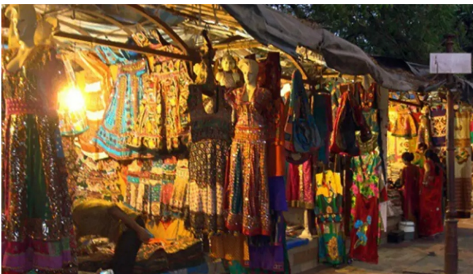
NIGHT MARKET OF LAW GARDEN

Located opposite Vasna Tol Naka near APMC Market, Vishalla offers a mesmerizing dining experience, recreating village life's serenity and beauty, with an ambiance as delicate as a dew drop.