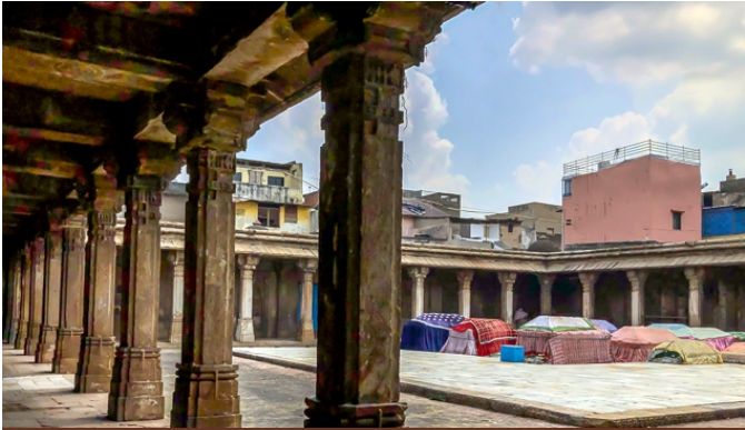
RANI NO HAJIRO

Rani No Hajiro, built in 1445 AD, is the tomb of Sultan Ahmed Shah's wife, Mugalbib. Located east of Manek Chowk, it also houses other royal female members' graves.