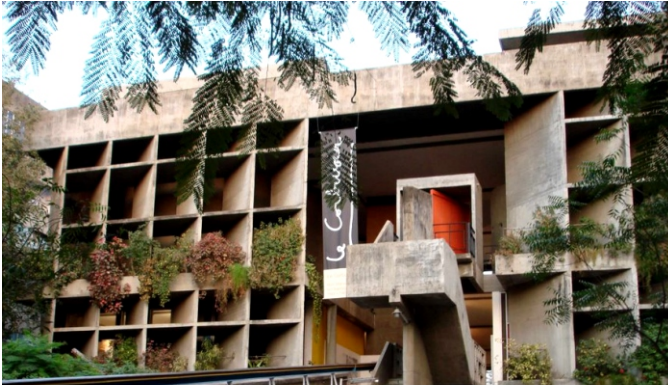
LE CORBUSIER ATMA HOUSE

The Ahmedabad Textile Mill's Association (ATMA), formed in 1891, promotes the organized textile sector. The current ATMA building, designed by renowned architect, was completed in 1954.