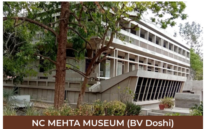
NC MEHTA MUSEUM (BV Doshi)

The N.C. Mehta Gallery in Ahmedabad, designed by B.V. Doshi, is part of the Lalbhai Dalpatbhai Museum complex and showcases a renowned collection of Indian miniature paintings.