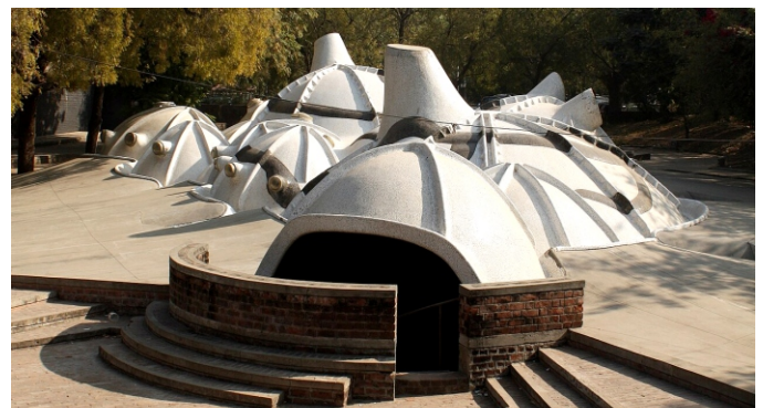
'AMDABAD NI GUFU' (B.V. DOSHI)

Hussain Doshi Gufa, an underground art gallery designed by architect B.V. Doshi, showcases works by renowned painter M.F. Hussain. Its unique structure, resembling a cave, gives it the name 'Gufa'.