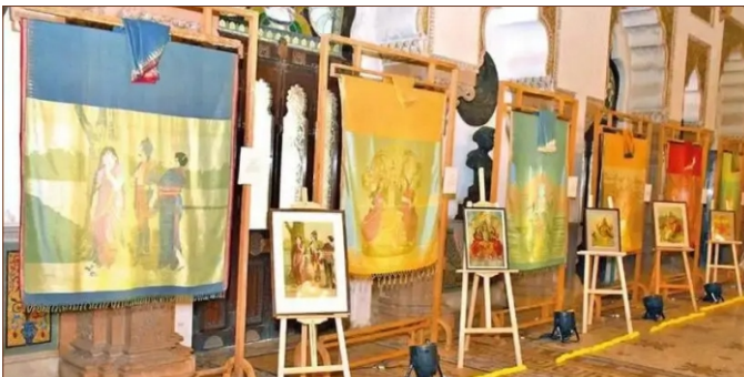
RAJA RAVI VARMA COLLECTION (Art Collection of the Maharaja of Baroda)

Raja Ravi Varma was a prominent artist and a pioneer of the modern Indian art movement. He is known for his oil paintings, which often depicted scenes from Indian mythology and history. His work is characterized by its vibrant colors and detailed depictions of figures and landscapes. He is also known for his contributions to the field of Indian art education and for his role in the development of the Indian art market.