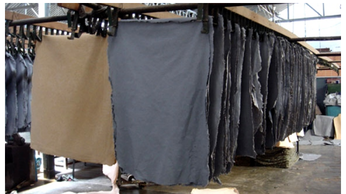
GANDHI ASHRAM PAPER FACTORY

Mahatma Gandhi established the Satyagraha Ashram in 1917 after moving from Kochrab Ashram. From here, he launched the non-cooperation movement and began the Salt March. A museum highlights his life and work.