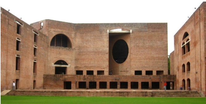
LUIS KAHN - IIM (Indian Institute of Management)

The Ahmedabad Textile Mill's Association (ATMA), formed in 1891, promotes the organized textile sector. The current ATMA building, designed by renowned architect, was completed in 1954.