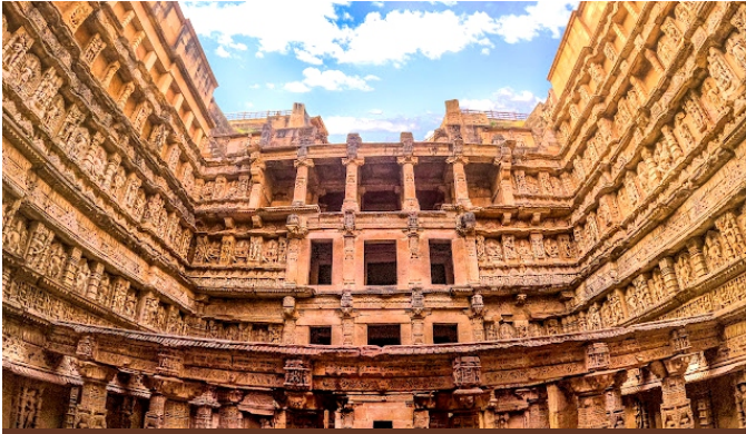
PATAN (STEP WELL, DOUBLE IKAT TEXTILE)

Rani ki Vav, a UNESCO World Heritage Site in Gujarat, was built (between 950 and 1300 AD.) by Queen Udaymati in memory of her husband, King Bhima I of the Chalukya dynasty, on the Saraswati River's banks.