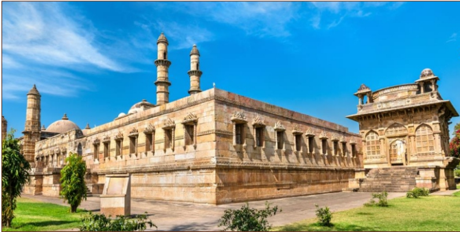
CHAMPANER (WORLD HERITAGE SITE) PAVAGADH TEMPLE TREK

Declared a World Heritage Site in 2004, Champaner Pavagadh Archaeological Park in Gujarat features excavated and unexcavated sites, including a 16th-century Hindu hill fortress with palaces, temples, and water installations.