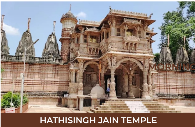
HATHISINGH JAIN TEMPLE