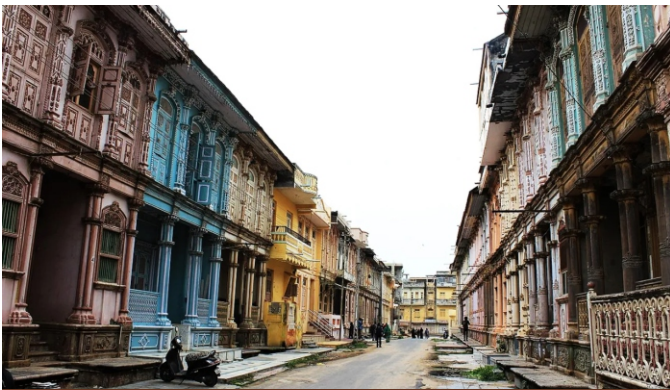
SIDHPUR (WOODEN MANSIONS)

Sidhpur, 103 km from Ahmedabad, is a sacred town on the Sarasvati River, named after ruler Siddhraj Jaisinh. It is known for temples, kunds, and French-style villas, mainly inhabited by the Bohra community.