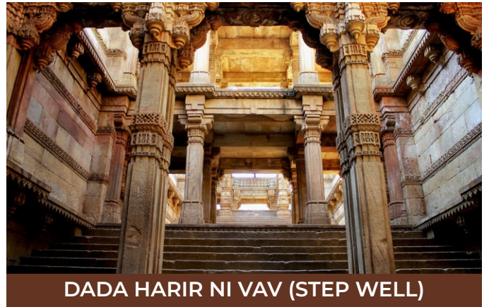
DADA HARIR NI VAV (STEP WELL)

Sultan Ahmed Shah I, founder of Ahmedabad, built Bhadra Fort in 1411 AD. Spanning 43 acres, it became the Gujarat Sultanate's capital. The city is named in his honor.