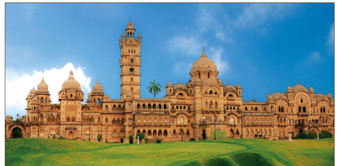
AUDIO TOUR OF LAXMIVILAS PALACE IN BARODA

Raja Ravi Varma was a prominent artist and a pioneer of the modern Indian art movement. He is known for his oil paintings, which often depicted scenes from Indian mythology and history. His work is characterized by its vibrant colors and detailed depictions of figures and landscapes. He is also known for his contributions to the field of Indian art education and for his role in the development of the Indian art market.